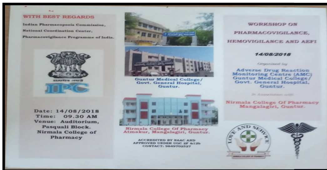
Brochure of the event

ORGANIZED BY: Department of Pharmacology