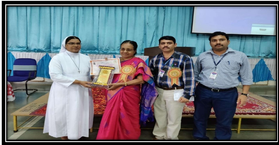
Conferring A Token Of Gratitude To Resource Person